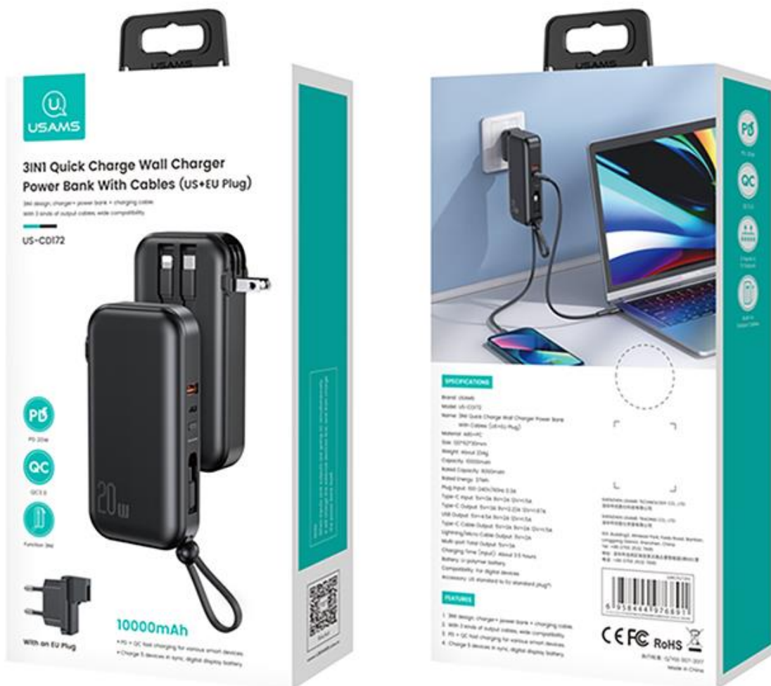
PB63 3IN1 Quick Charge Wall Charger Power Bank With Cables (US+EU Plug) US-CD172