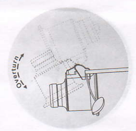
Eyeflap can be overturned freely.