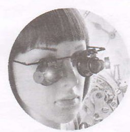
Turn on the light source if insufficient light

It is quite inconvenient to use common clock repair magnifier by clamping it with eyelid, which might affect the repair quality of precise instruments and clocks. This magnifier adopts eye glasses design function. When magnifying function is not used, eyeflap can be overturned freely without taking off glasses frame which brings convenience to users and makes it easier and more precise to repair precise instruments and clocks.